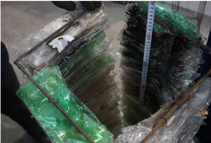
Figure 4 Measurement of the burnt and residual lengths, which corresponded to 340 mm and 460 mm, respectively, during the flammability and optical density smoke tests. According to DIN 4102-1, the material exhibits low flammability when the residual length is at least 150 mm for all tests.

PET bottles showed a reduced amount of fumes because it was classified as Level 1 according to IRAM 1192. This level corresponds to the best score that can be achieved according to this standard. In addition, PET bottles had low flammability because they were classified as B1 according to DIN 4102-1, Figure 4 . These results were obtained for the four tested specimens, which confirm similar characteristics between specimens and standardization in the manufacturing process. Although it is true that these PET bottles presented greater compaction than the plastic molds ( Figure 1b ), these results confirm that PET is a suitable material for use in construction.