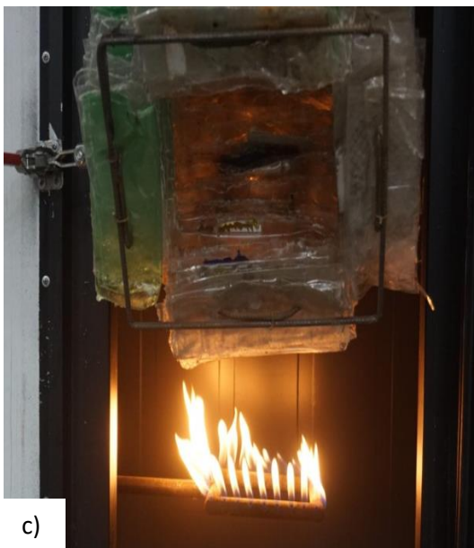
Figure 2 Photographs that show testing of combustibility and optical density of recycled PET bottles. a) Lattice of metal rods for the manufacture of the test tube, b) arrangement of the PET sheets extracted from the bottles to be able to form the test tube, c) detail of the burners located in the lower part of the test tube.

The stationary heat transfer properties of the building elements were determined (IRAM 11564). A square specimen with a 2.4 m edge and 0.205 m thickness was tested, using the hot box method with a storage box. This specimen consisted of 16 molds of PET bottles inside a wooden frame covered by gypsum panels on both sides. During the 120 h test, the ambient temperature was 21.9°C. Resistance to fire was characterized with IRAM 11949 and IRAM 11950 standards. A representative sample of a real case of a wall was used, that is, a 3m x 3m surface test piece, Figure 1b . This specimen was evaluated as a simple closure without load. To simulate the fire condition, a combustion furnace with eight burners was used on each vertical wall. The temperature measurement on the face of the exposed sample outside the oven was performed with five thermocouples located as shown in Figure 3 . At the time of starting the test, the ambient temperature was 15°C.