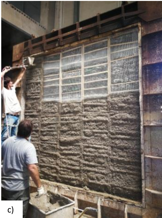
Figure 1 a) Works with the manual press activated by pulley. b) Pile of compacted plastic bottles. c) Dimensions and distribution of the wooden slats containing the plastic molds and the application of cementitious plaster.